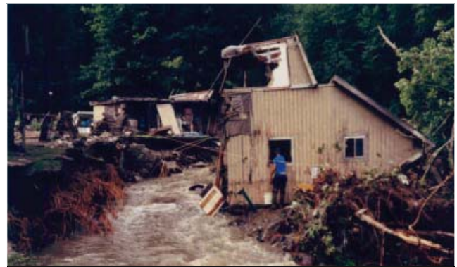
Catastrophic erosion during the 1990 flood, Great Brook, Plainfield, VT