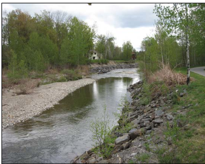
Encroachments on a straightened and incised channel that must now be maintained as a channelized river transferring its erosive energy and sediment load to downstream reaches.

Landowners and local governments need to hear a consistent message about channelization practices from state and federal resource agencies. Cost share programs, technical guidance, and other land use incentives for local governments and private landowners that discourage river corridor encroachments will achieve the goals of the Clean Water Act faster than promoting "greener" structural measures to protect ill-conceived encroachments. Moreover, once state and federal agencies are in agreement, they will need to find the political fortitude necessary to change public programs so as not to intervene on every eroding stream bank, thereby allowing streams to evolve back to equilibrium conditions. Without a state-federal partnership, the traditional river management paradigm will persist; one that accommodates land use encroachments in the river corridor, a never-ending cycle of erosion hazards, and costly channel management imperatives that rely on traditional structural measures.